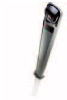
900TOWER2F Photocell double mounting post, painted aluminium, 98 cm, with removable cover for easy installation and photocell adjustment