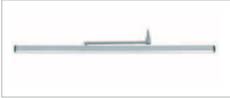
S-10DOORBST Track (PULL operation)