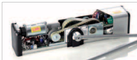
Compact and reliable operator