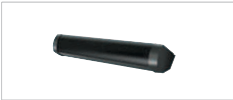
S-10DOORSS340 Safety sensor for obstacle detection